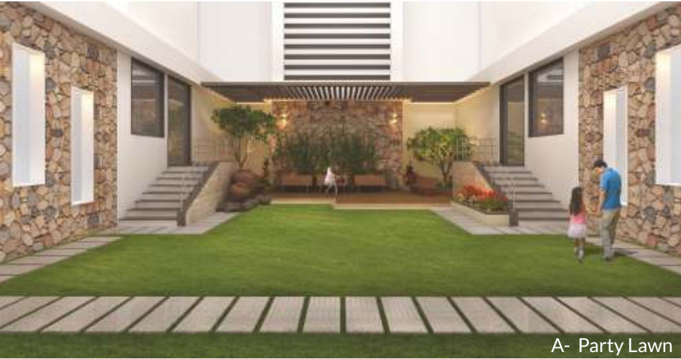
A- Party Lawn

Breaking the monotony of concrete spaces the carefully fabricated amenity spaces at Casa Feliz bring together inspired design and sophisticated living. The result is a home accompanied by serene greens.