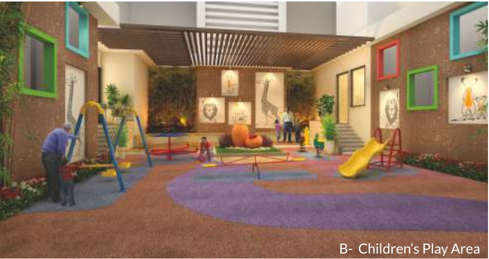
B- Children's Play Area