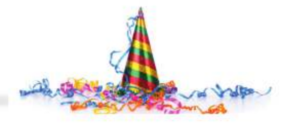
Party Hall & Lawn with Landscaped Garden