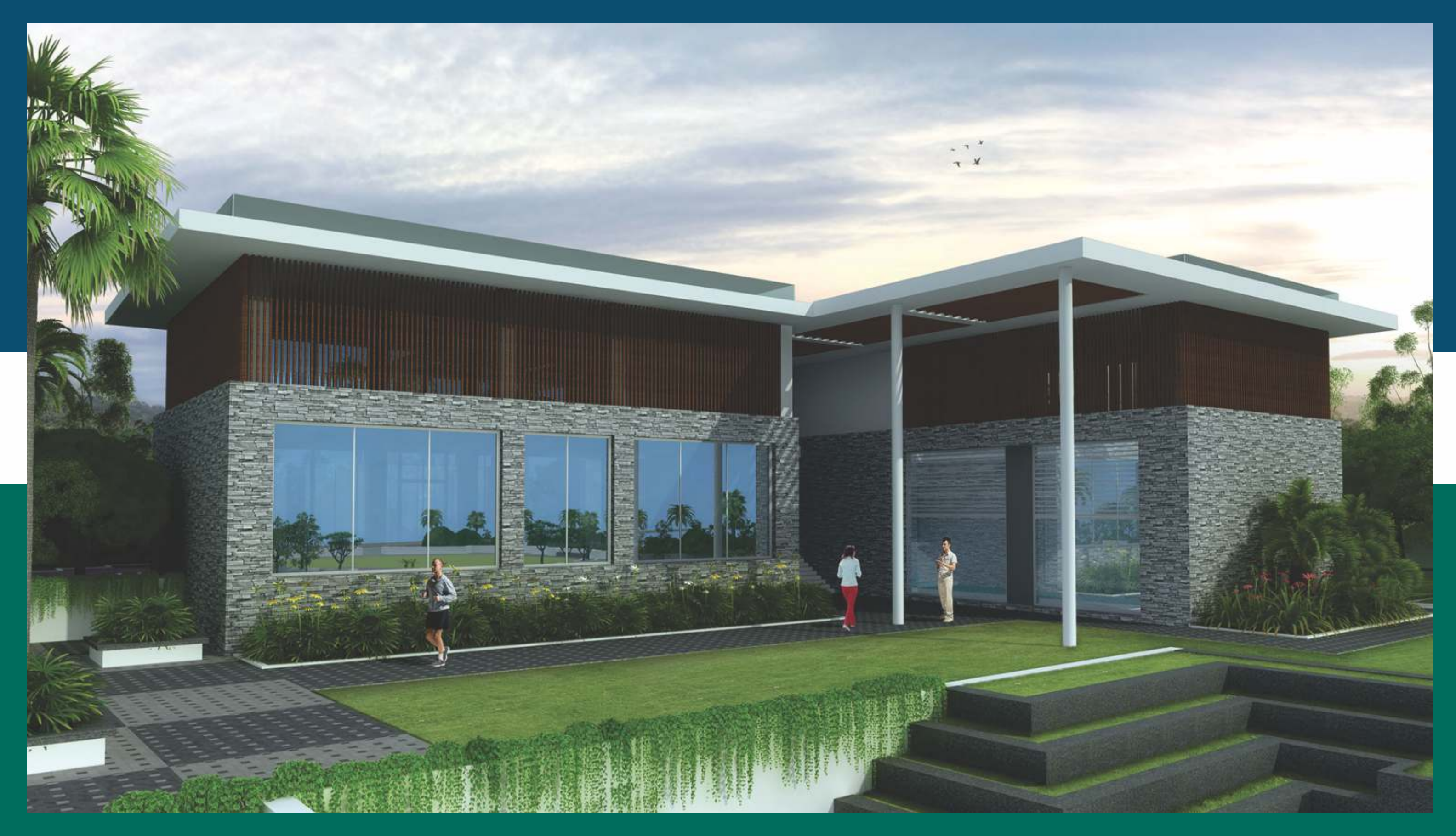
CLUB HOUSE VIEW