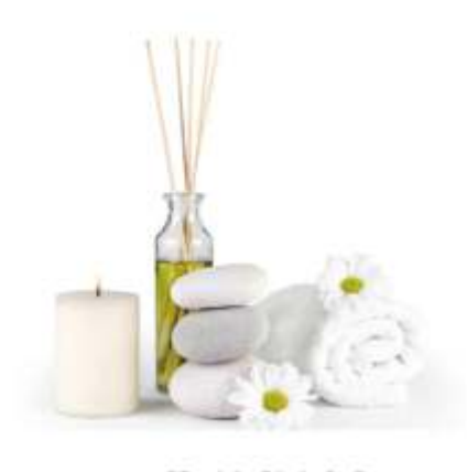
Health Club & Spa