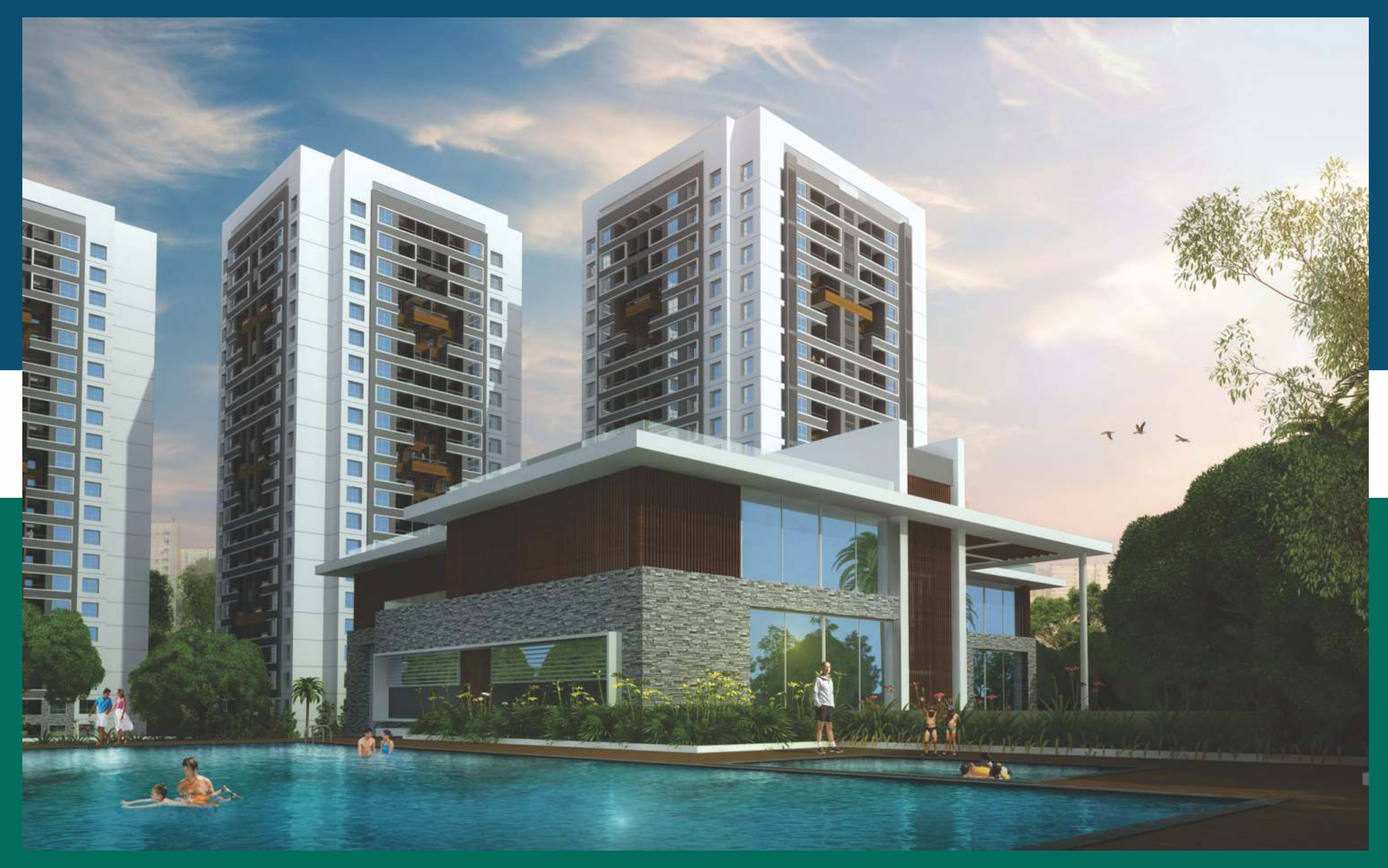
CLUB HOUSE VIEW