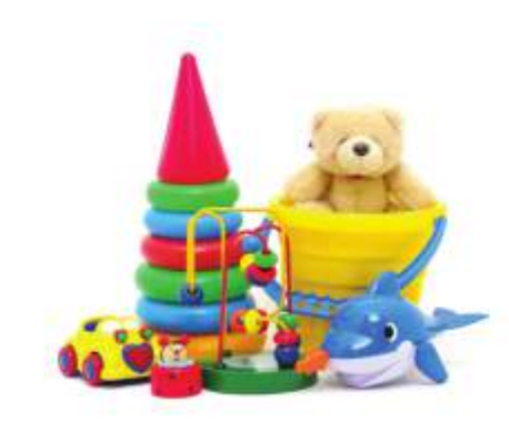
Kids' Play Area & Creche