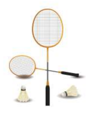
Indoor Badminton Hall