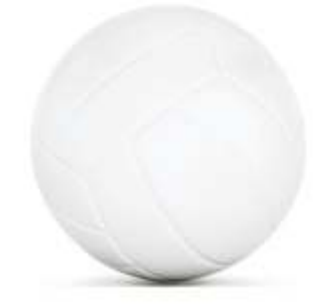
Volley Ball Court