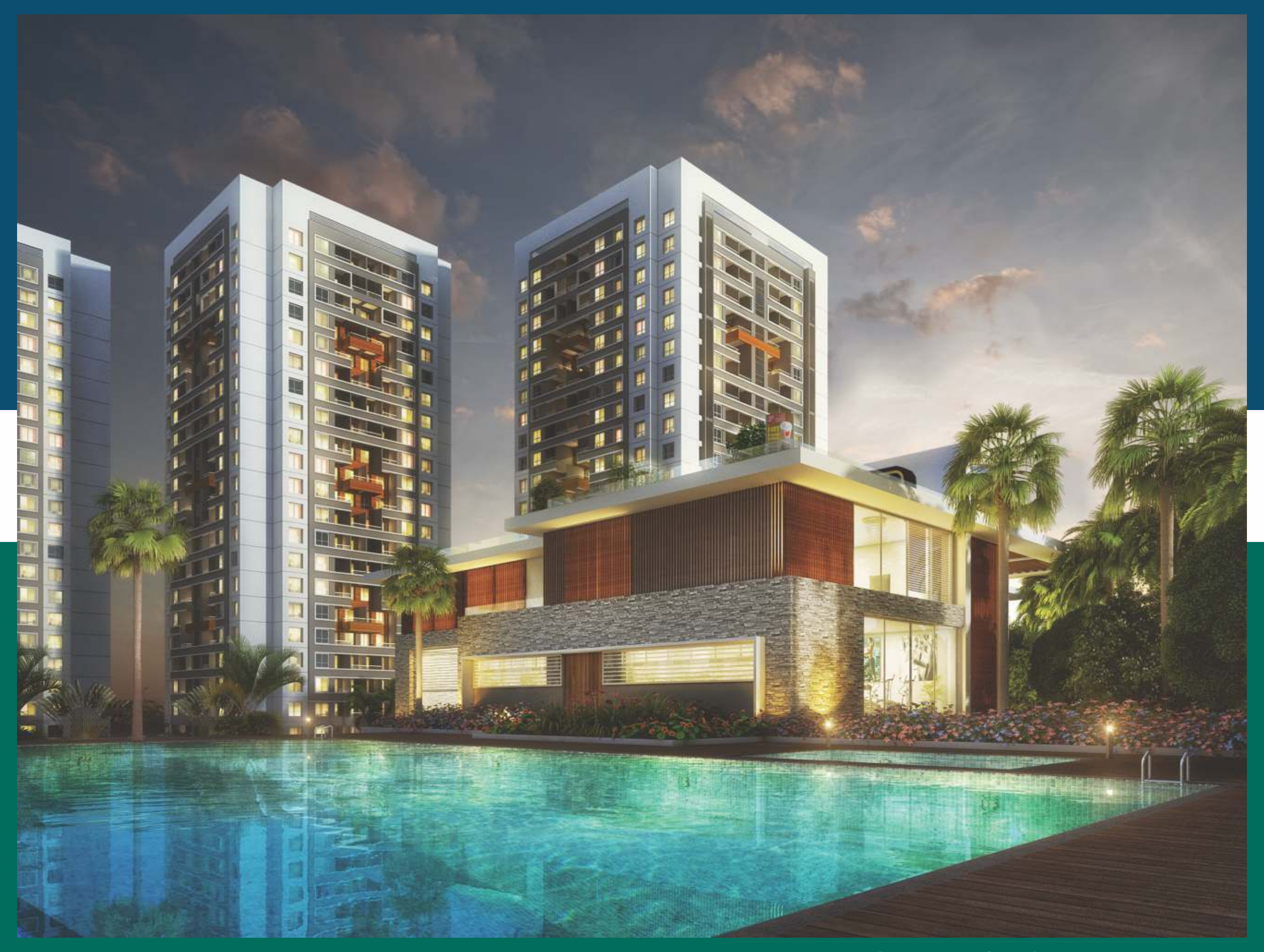
CLUB HOUSE NIGHT VIEW