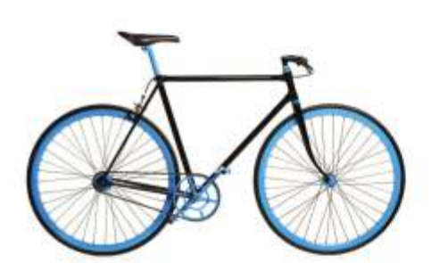
Cycling Track & Cycle Parking