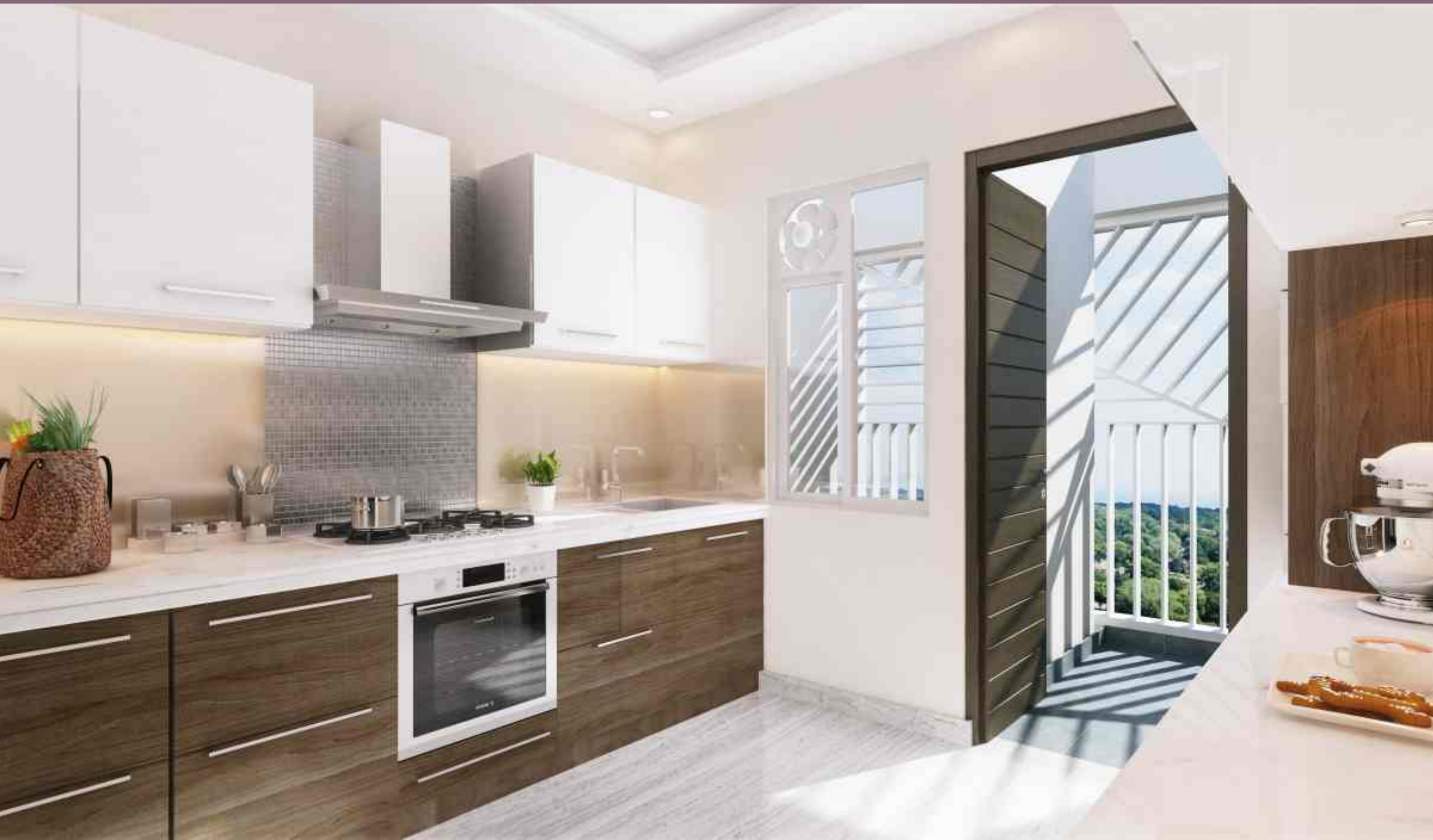
In this kitchen adorned with perfect ambience and convenience, culinary arts are bound to create masterpieces that please everyone.