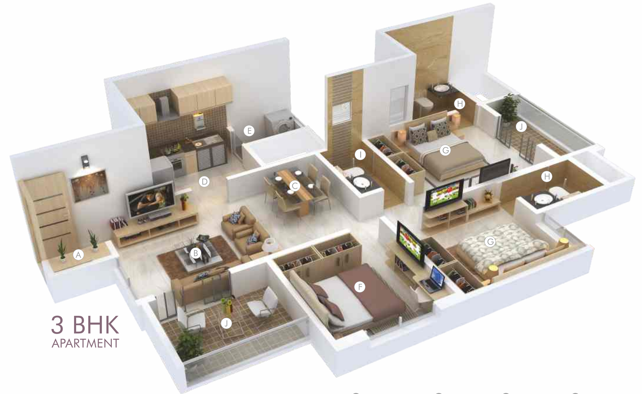
3 BHK APARTMENT