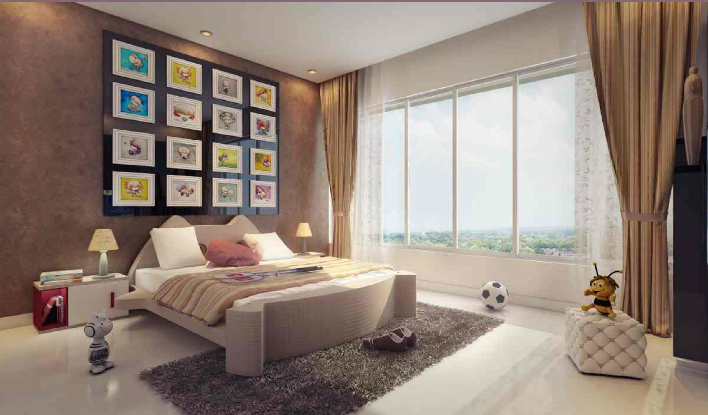
The innocent joys liesures are what these bedrooms are designed for. Let your precious child relax in the world created exclusively for him.