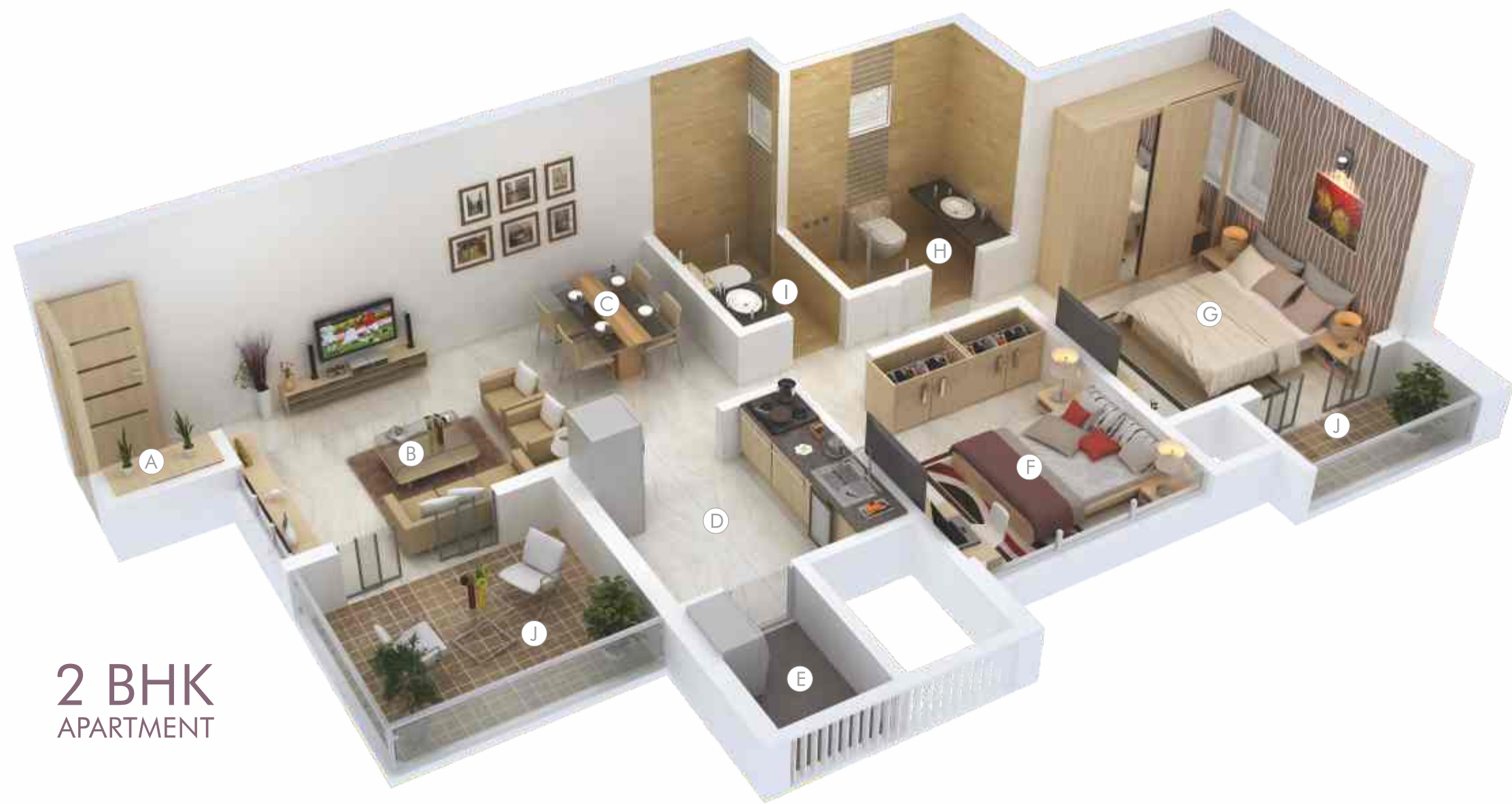
2 BHK APARTMENT