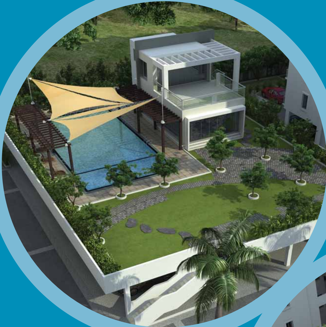
Club & Swimming Pool