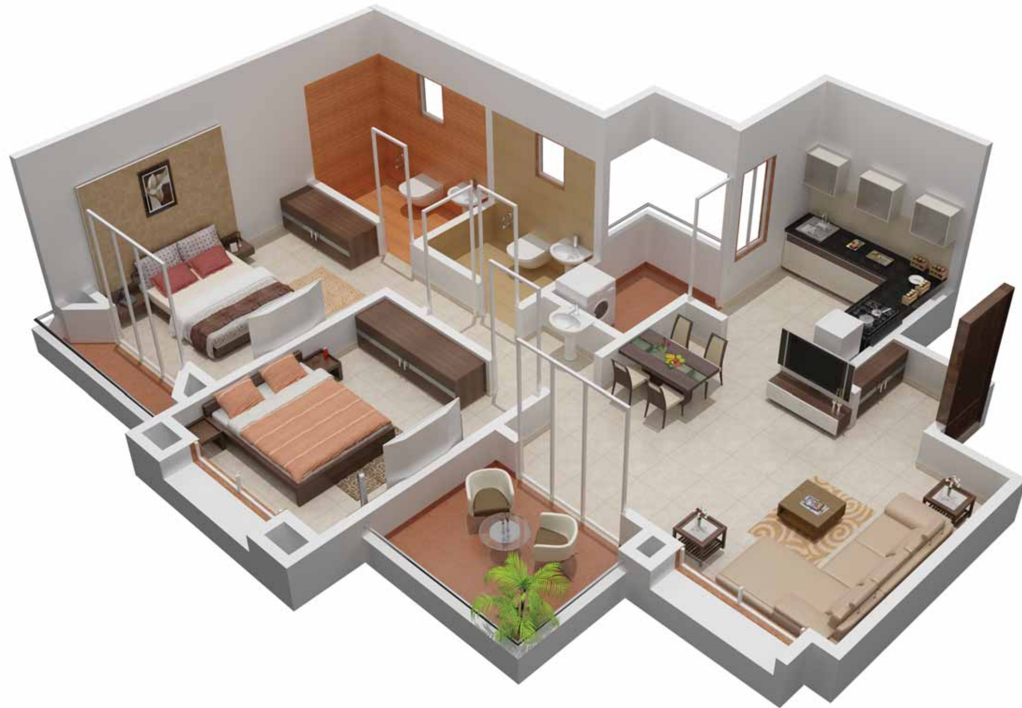
2 BHK LAYOUT