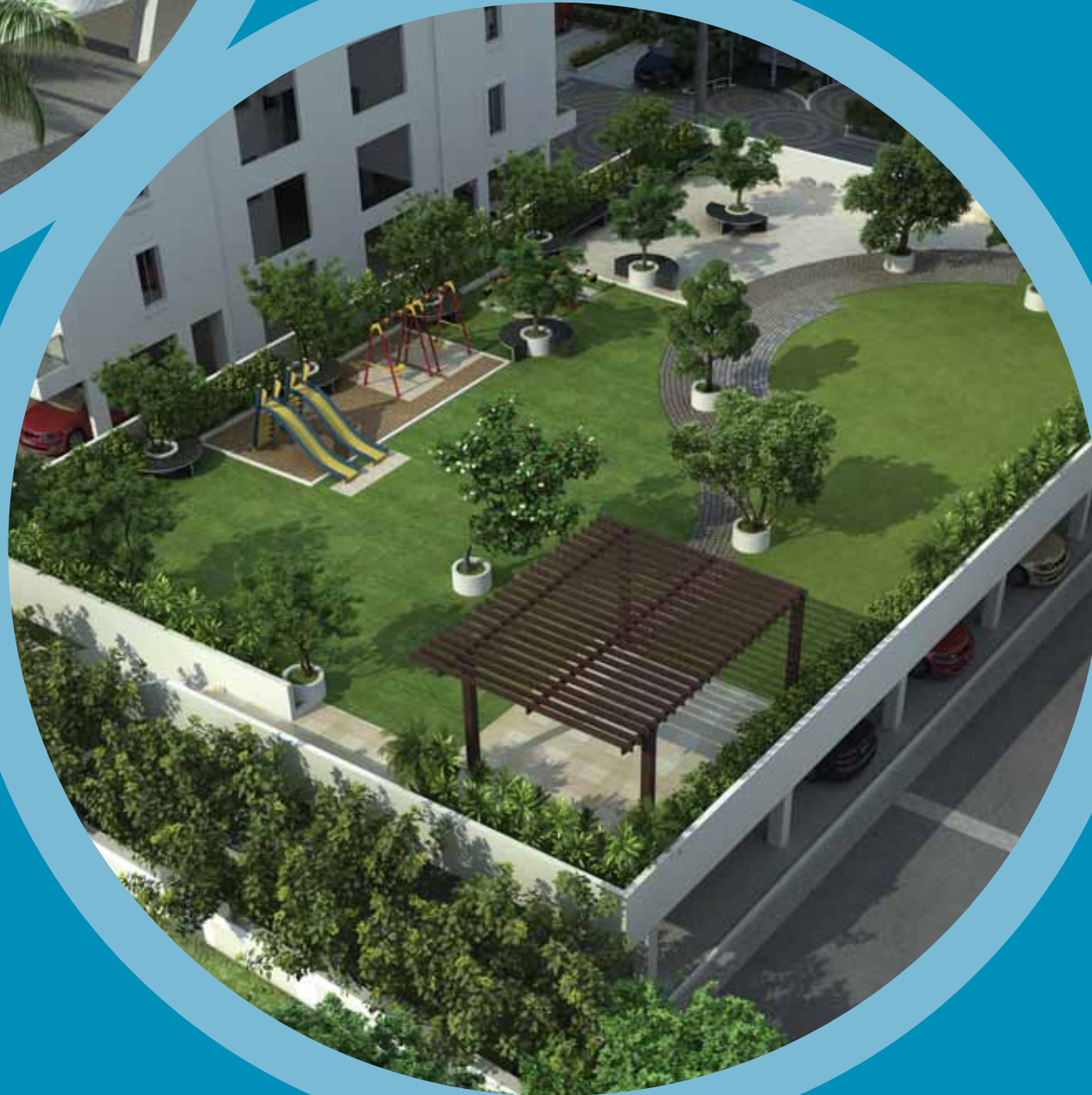
Yoga and Play area