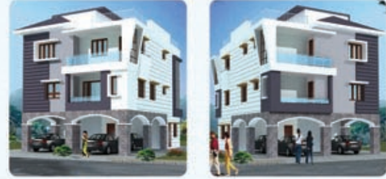
TRIPLEX HOUSES @ MANIKONDA HYDERABAD