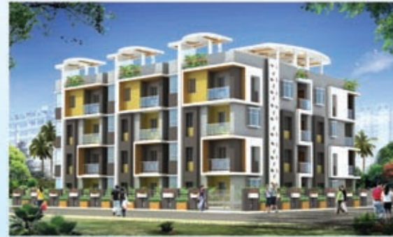
APARTMENT @ YELAHANKA BANGALORE