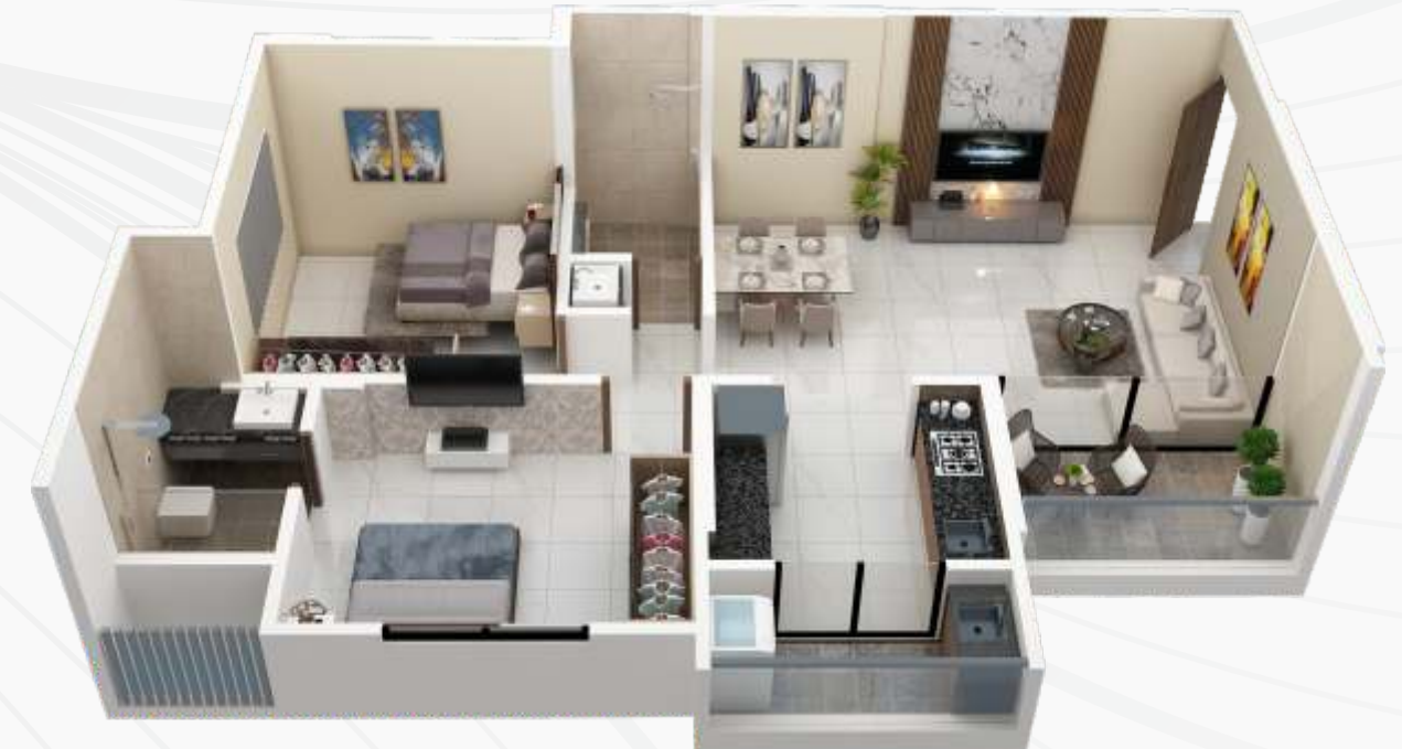
Type 2 - 721 Sq.Ft. (Carpet Area)