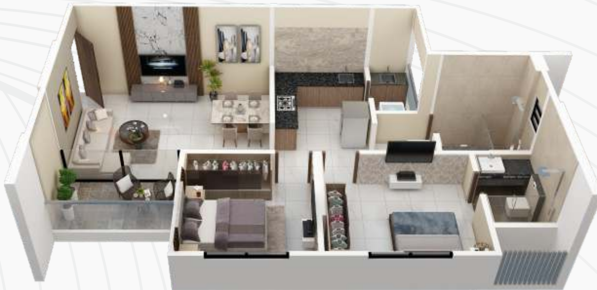
Type 1 - 690 Sq.Ft. (Carpet Area)