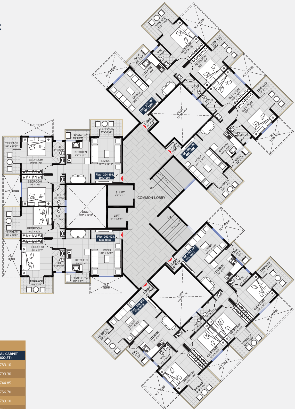
2ND, 4TH, 6TH, 8TH & 10TH EVEN FLOOR PLAN (C AND D WING)