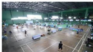
PRAKASH PADUKONE BADMINTON ACADEMY