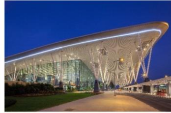
BANGALORE INTERNATIONAL AIRPORT