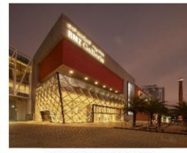
RMZ GALLERIA MALL