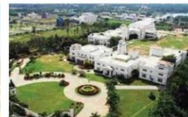
CANADIAN INTERNATIONAL SCHOOL