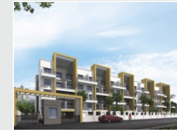
PARAMOUNT SWAMIDHAM Kondhwa Bk., Pune