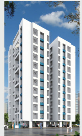
PARAMOUNT EROS Katraj-Kondhwa Road, Pune