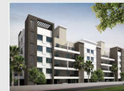
PARAMOUNT OZAERO Ambegaon Kh., Pune