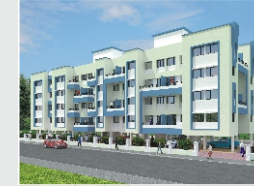
SWAMI VRINDAVAN Sai Nagar, Kondhwa Bk., Pune