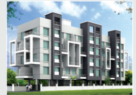
GOVINDKUNJ Kondhwa, Pune