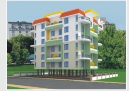
SWAMI VATIKA Katraj, Pune