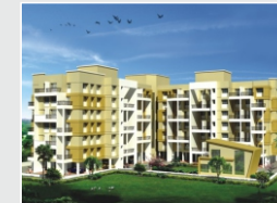
PARAMOUNT MADHUBAN Kondhwa Bk., Pune