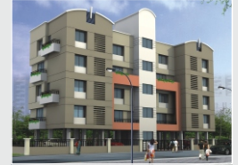
OASIS RESIDENCY Sukhsagar Nagar, Pune