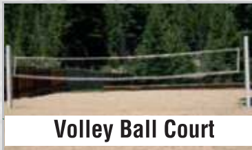
Volley Ball Court