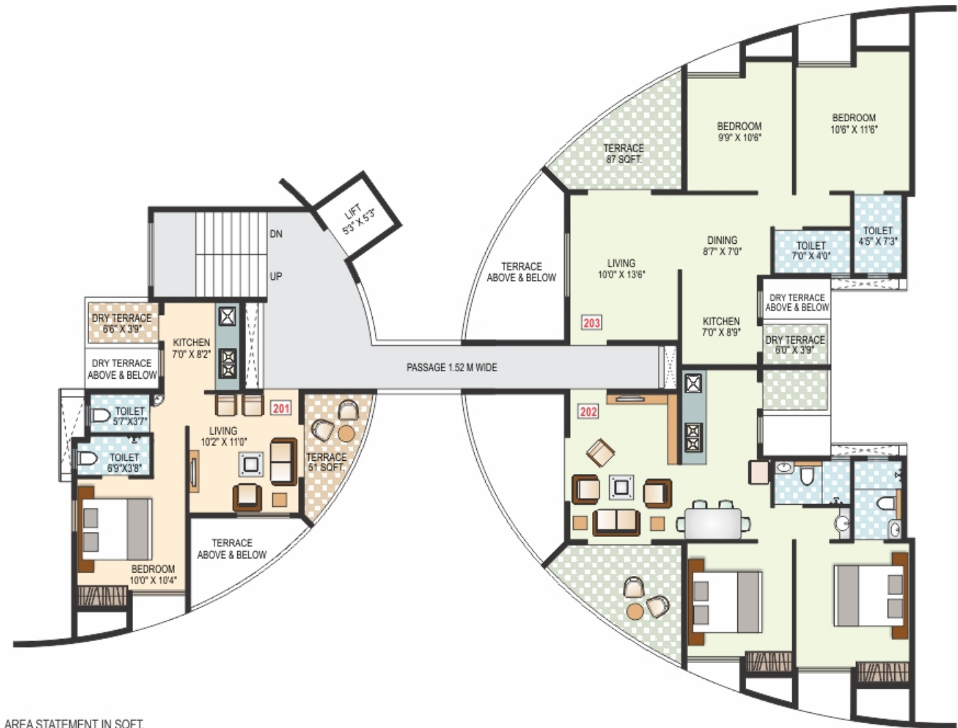
AREA STATEMENT IN SQFT.