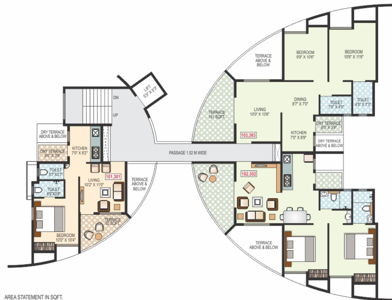
AREA STATEMENT IN SQFT.