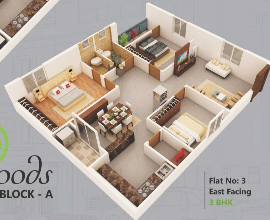
Flat No: 3 East Facing 3 BHK