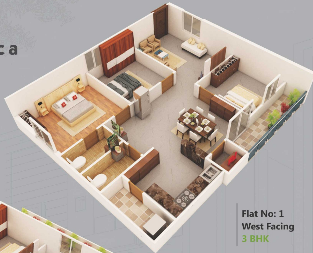
Flat No: 1 West Facing 3 BHK