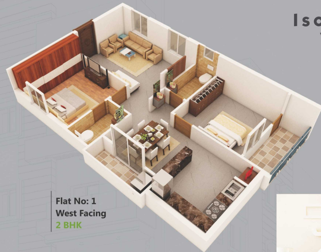
Flat No: 1 West Facing 2 BHK