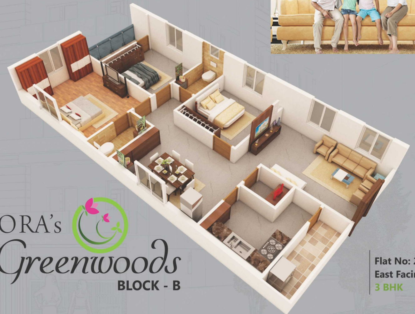
Flat No: 2 East Facing 3 BHK