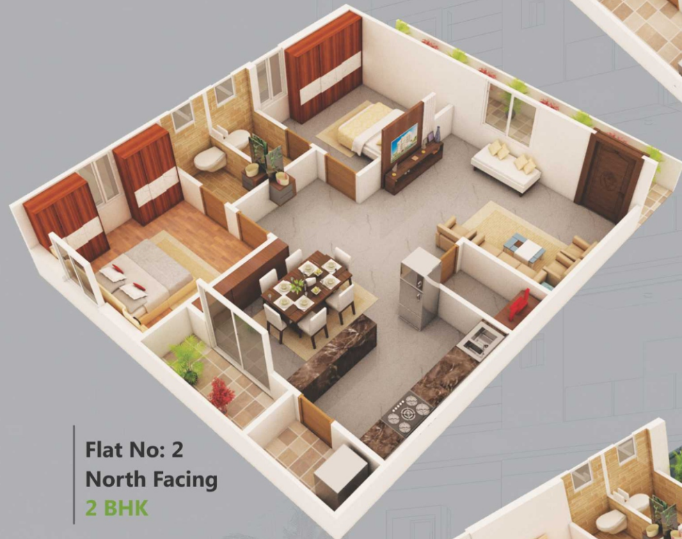
Flat No: 2 North Facing 2 BHK