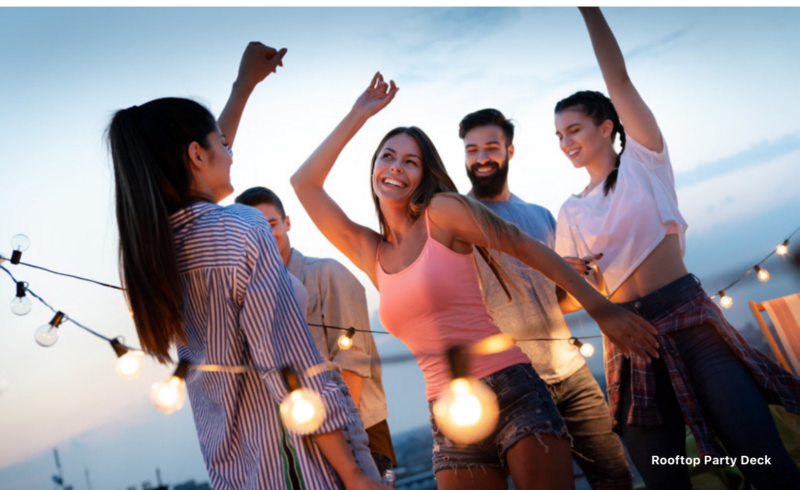
Rooftop Party Deck