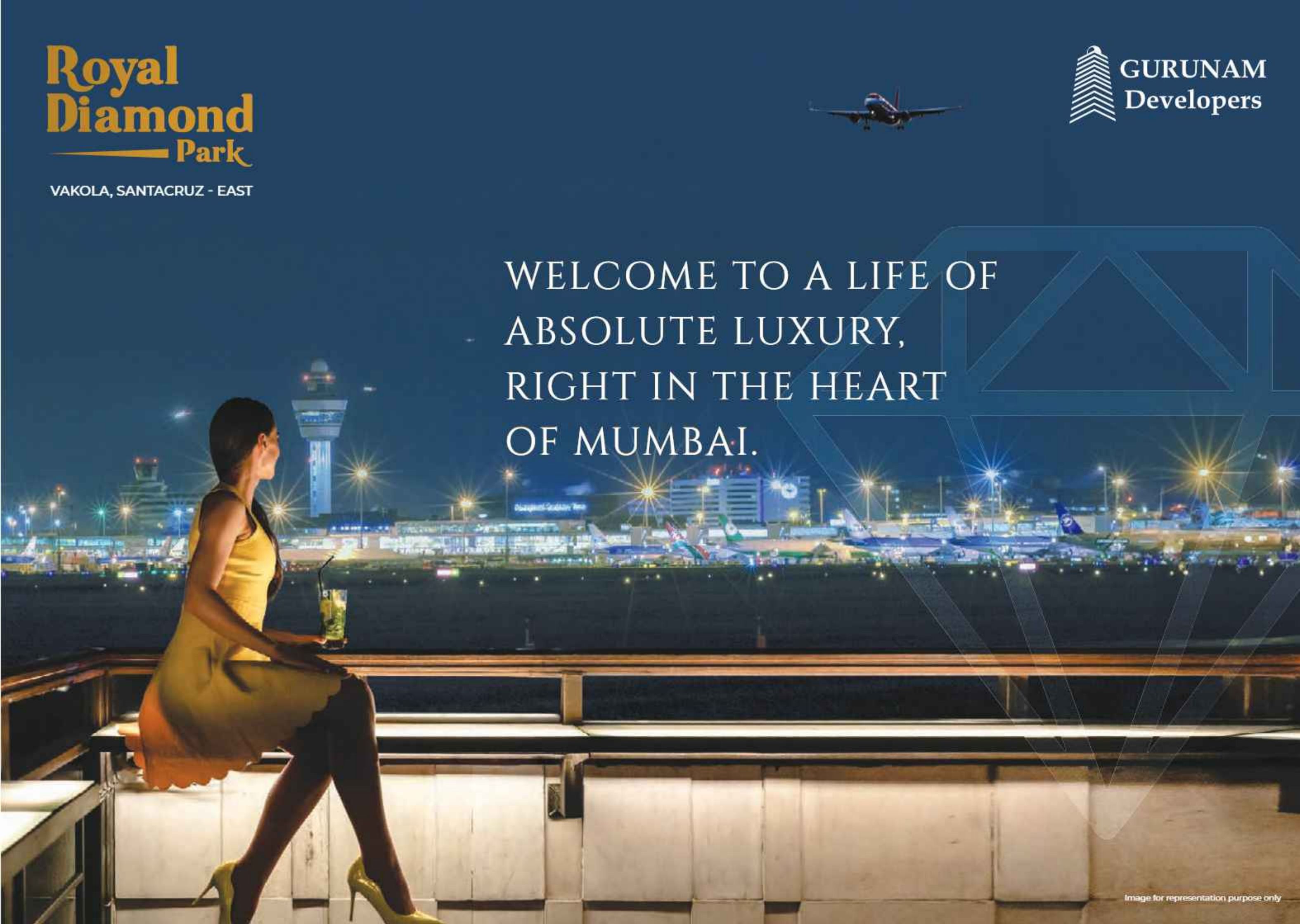
Image for representation purpose only

WELCOME TO A LIFE OF ABSOLUTE LUXURY, RIGHT IN THE HEART OF MUMBAI.