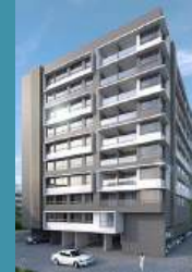
PREKSHA Dadar (E) Started Feb 2018 Delivered Oct 2021