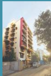
SHIV SHAKTI Mulund Started Jul 2011 Delivered Nov 2013