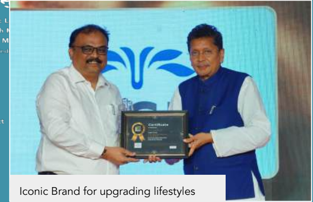
Iconic Brand for upgrading lifestyles