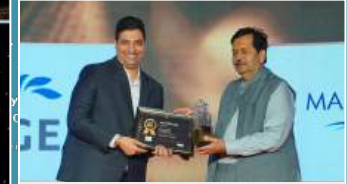
Super Iconic Luxury Project Sugree Marina Bay