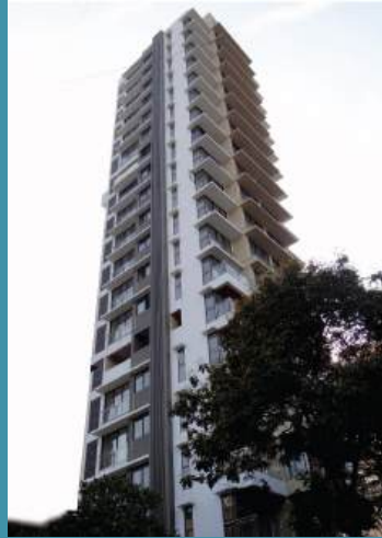
SUGEE PAAVAN Matunga Started Aug 2019 Delivered Apr 2023