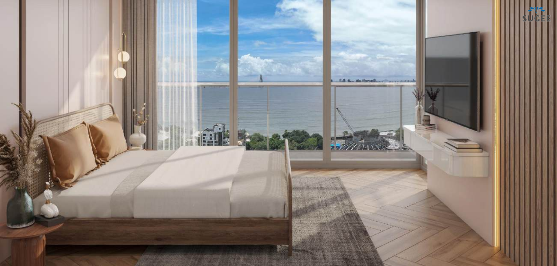
A SPACIOUS BEDROOM FOR EVERYDAY RELAXATION