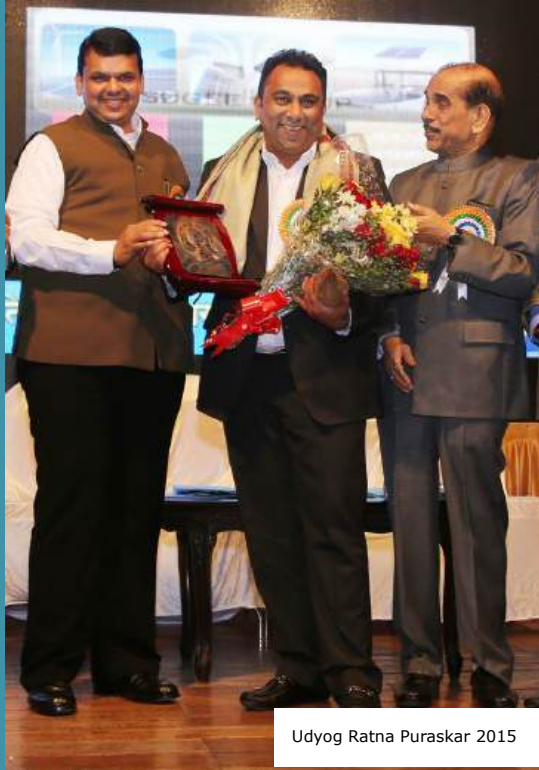
Udyog Ratna Puraskar 2015