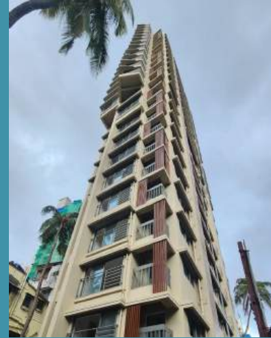
SUGEE SUBHADHA Swatantryaveer Savarkar Marg Started Dec 2020 Delivered Sep 2023