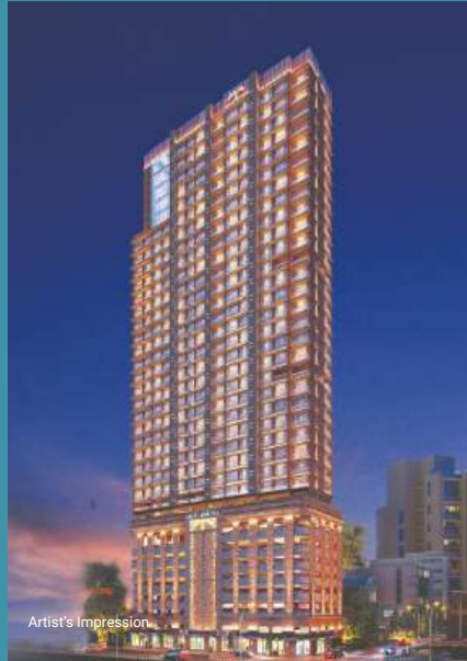
SUGEE AKANKSHA Gokhale Road