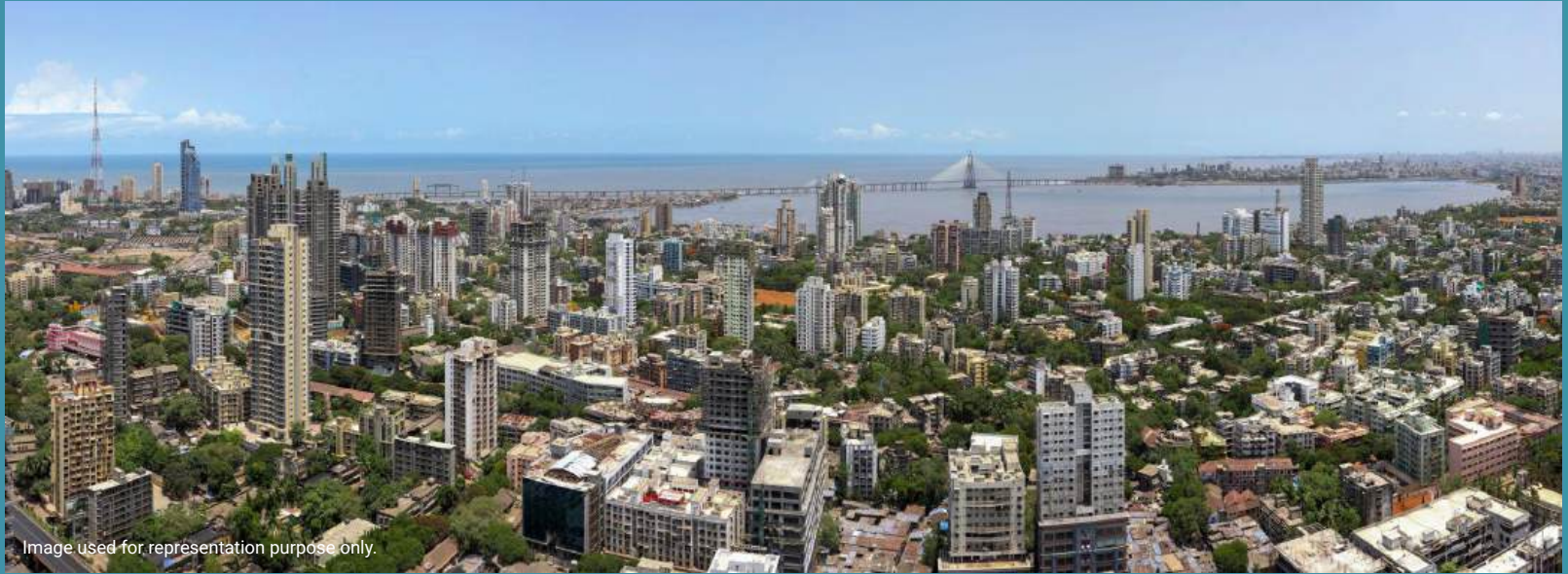
Image used for representation purpose only.