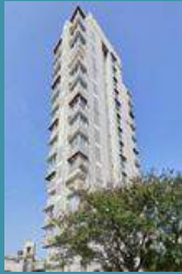
GOVIND SADAN Chhatrapati Shivaji Maharaj Park Started Aug 2017 Delivered Jan 2020