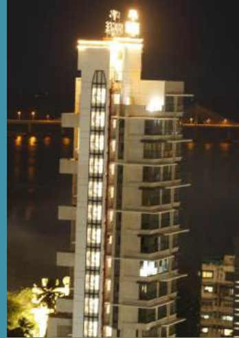
SUGEE PARIMAL Chhatrapati Shivaji Maharaj Park Started Feb 2018 Delivered Oct 2022