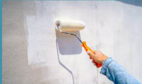
Damp Proof External Coating