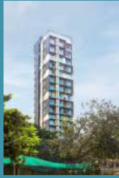
SUGEE TRIMURTI Chhatrapati Shivaji Maharaj Park Started Oct 2015 Delivered Apr 2018