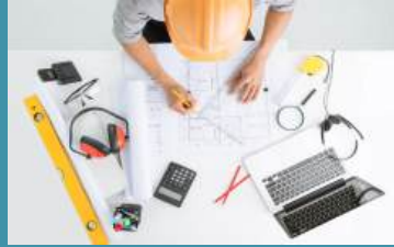
Excellence With Consultants