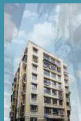
Om Sat Niwas Matunga (E) Started Oct 2017 Delivered Apr 2019