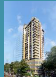
SUGEE SADAN Dadar (W) Started Jul 2014 Delivered Mar 2017