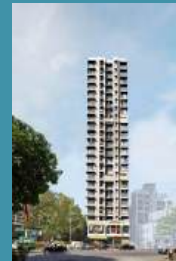
SANSKRUTI Dadar (W) Started Nov 2017 Delivered Dec 2021