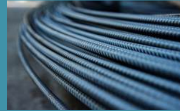
High Quality Steel