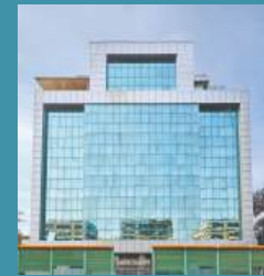
VAIBHAV CHAMBERS BKC, Bandra (E) Started Mar 2000 Delivered Jan 2003