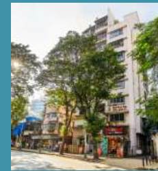
VAIBHAV APARTMENTS Dadar (W) Started Feb 2007 Delivered Oct 2009