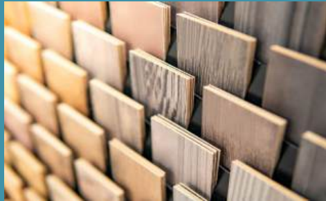
Veneer Finish Doors & System Windows