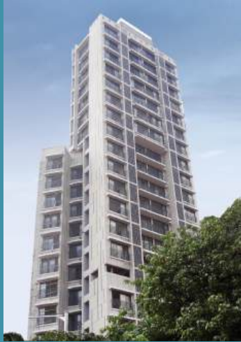
SUGEE LAXMI NIWAS Dadar West Started Mar 2018 Delivered Jan 2022