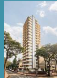
GANESH NIWAS Sion Started Jun 2018 Delivered Oct 2020