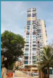
SUGEE HEIGHTS Mulund Started Apr 2009 Delivered Nov 2011