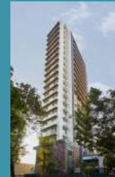
MAHALAXMI Hindu Colony Started Apr 2018 Delivered Dec 2021