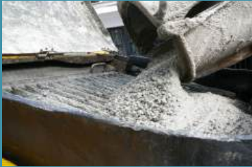
High Grade Concrete