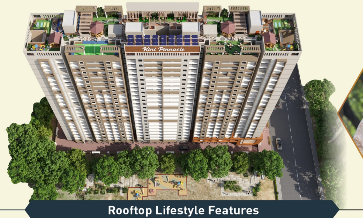
Rooftop Lifestyle Features