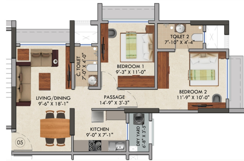
2BHK- 625 Rera Carpet