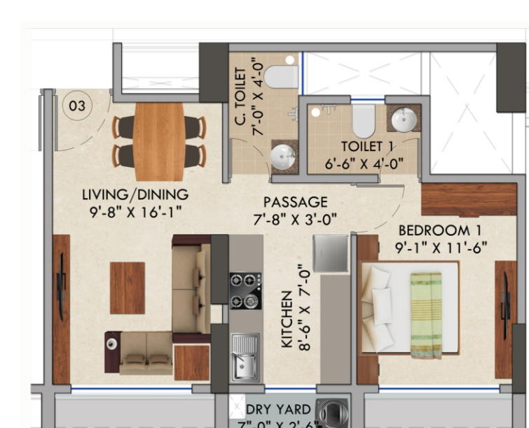
1BHK- 434 Rera Carpet