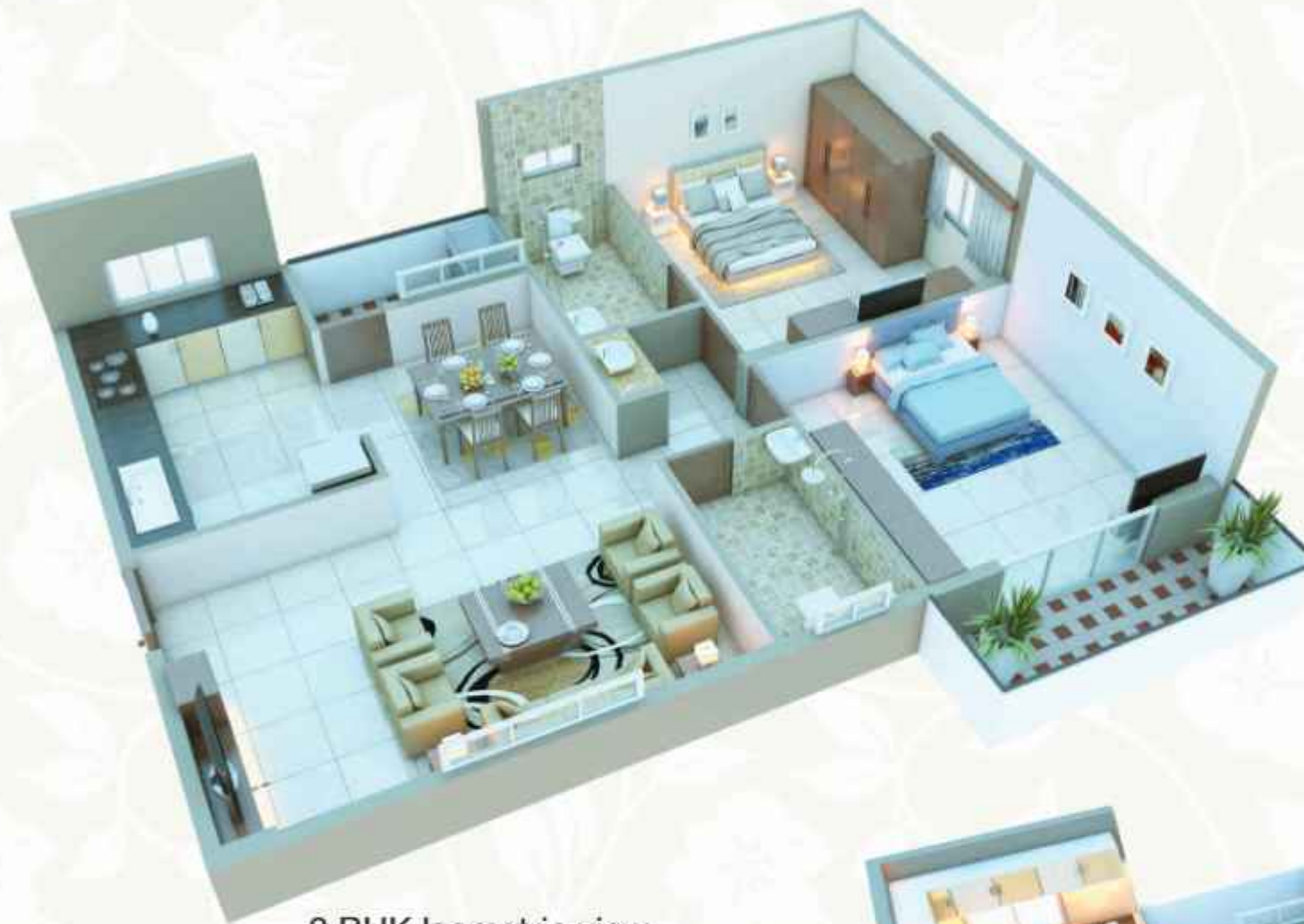
2 BHK Isometric view