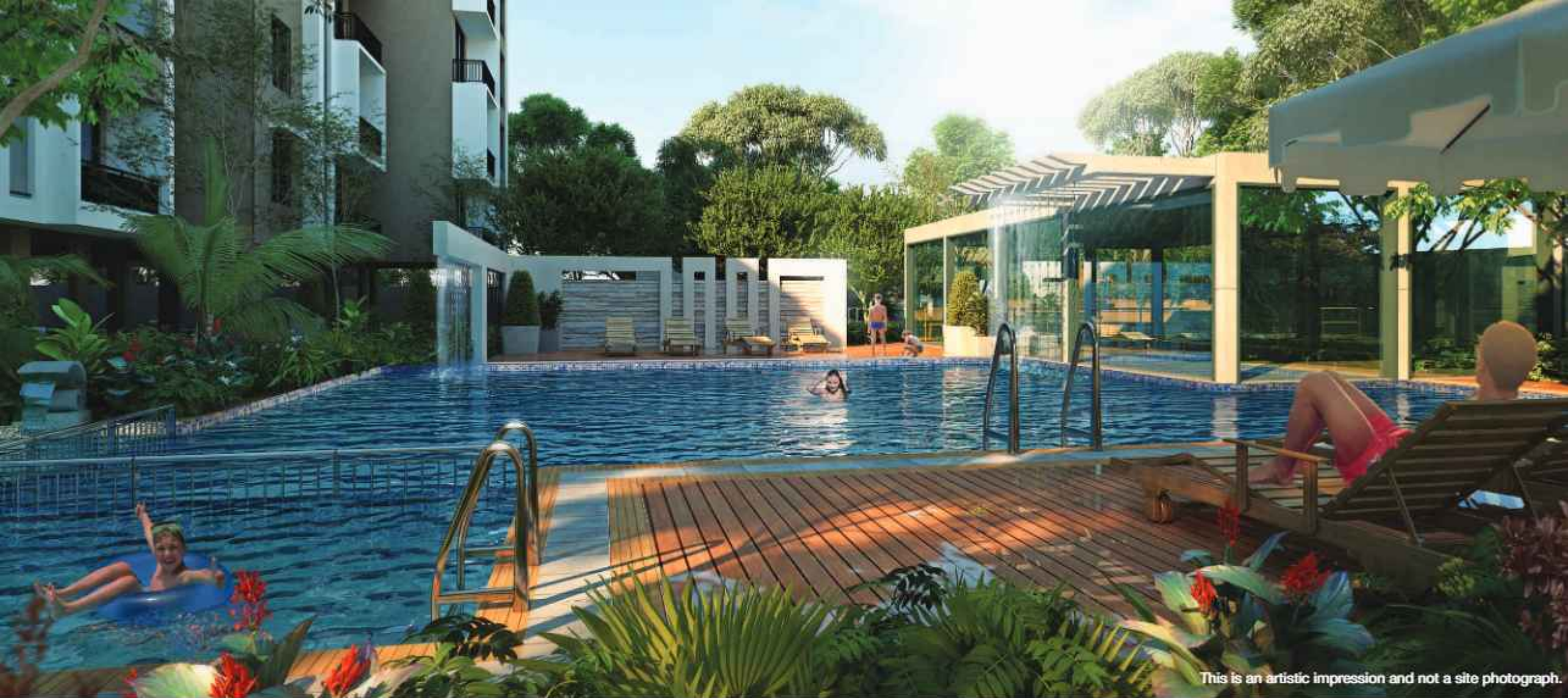
This is an artistic impression and not a site photograph.