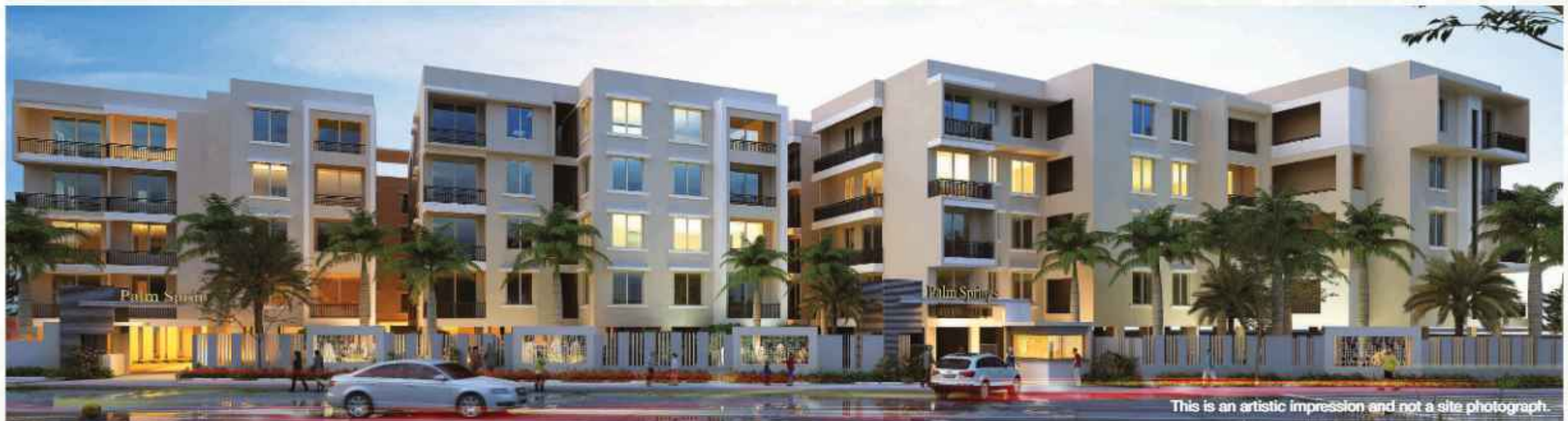
This is an artistic impression and not a site photograph.

15 Nos. 6 passenger automatic lift from stilt parking.