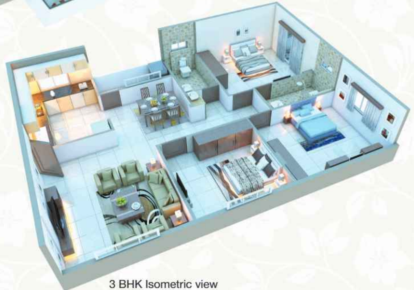
3 BHK Isometric view