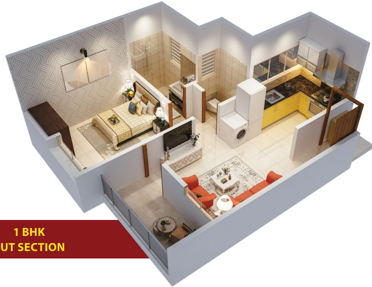
1 BHK CUT SECTION