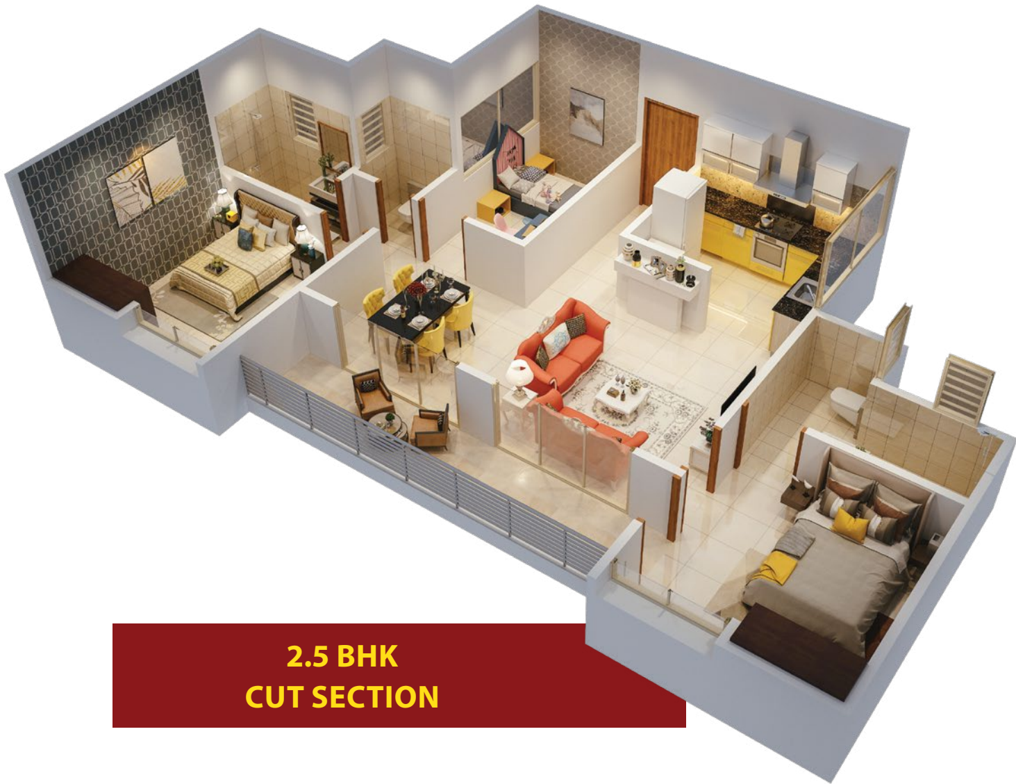
2.5 BHK CUT SECTION