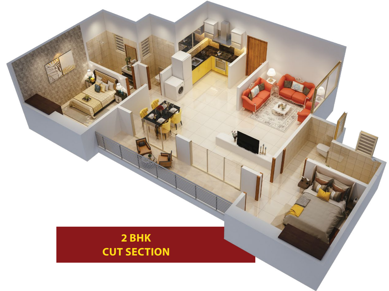
2 BHK CUT SECTION