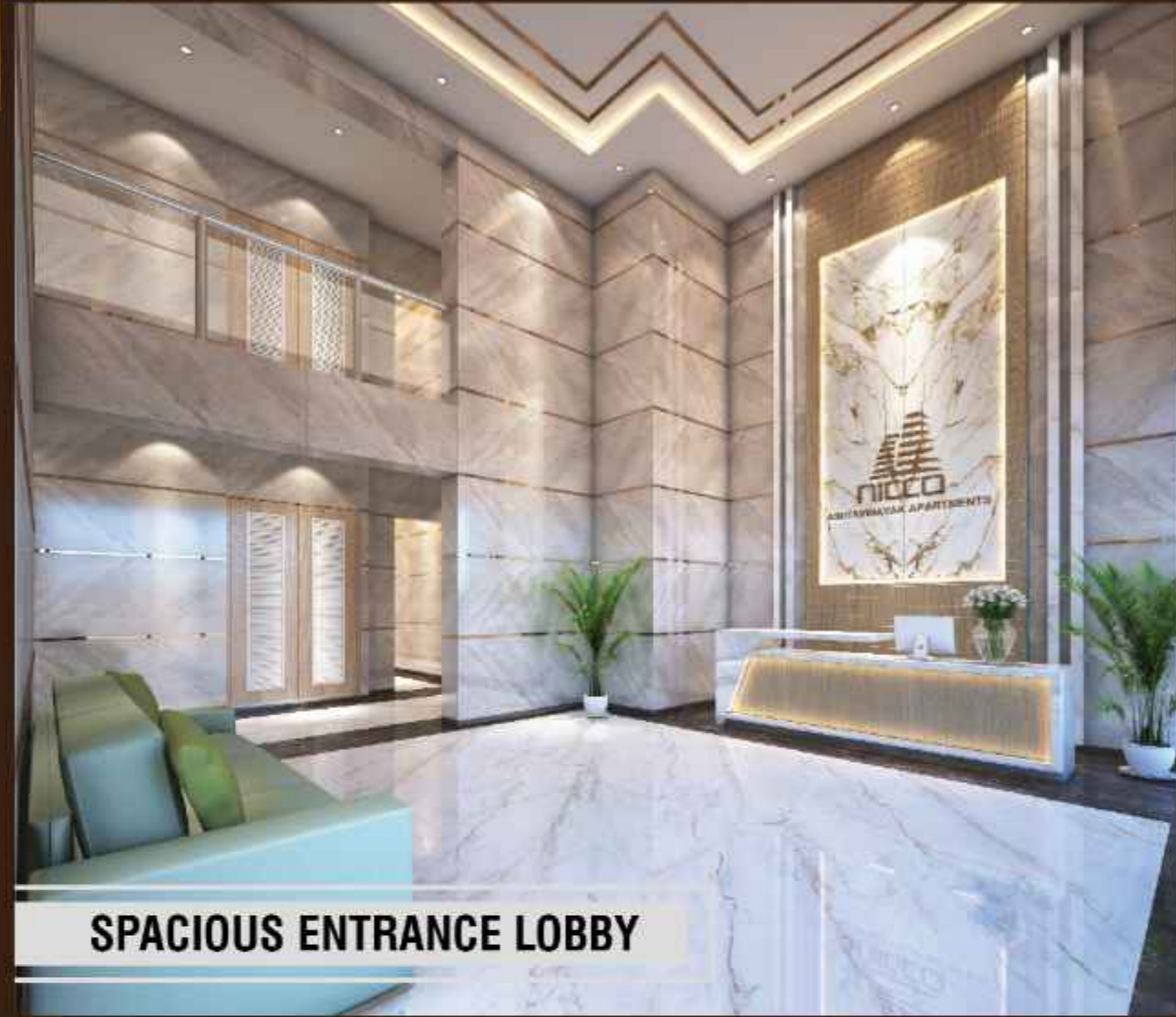
SPACIOUS ENTRANCE LOBBY