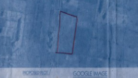
PROPOSED PLOT GOOGLE WAZE