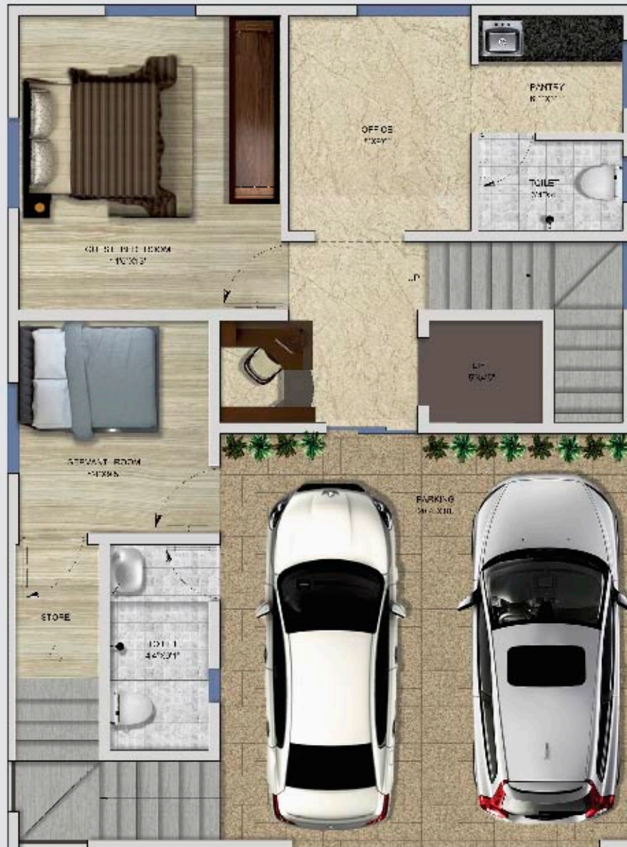
Ground Floor: 1045 Sqft (690 sqft – Personal Office, 2 Car Parking - 355 Sqft)