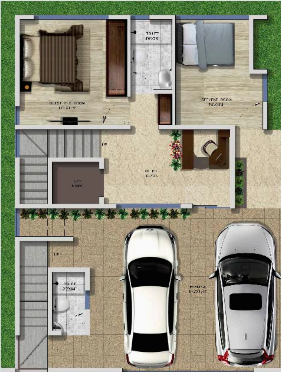
Ground Floor: 1015 Sqft (650 sqft – Personal Office, 2 Car Parking – 365 Sqft)