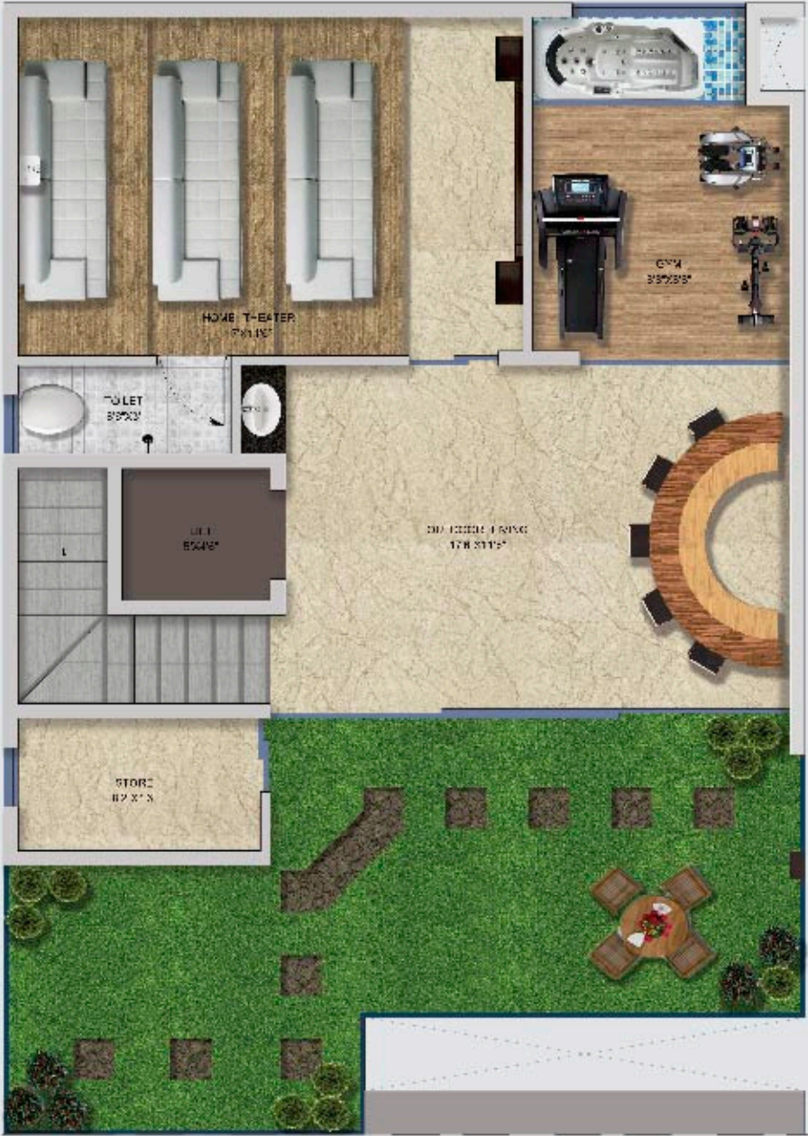
Third Floor : 1030 Sqft (House 700 Sqft & 330 Sqft of Terrace Garden)