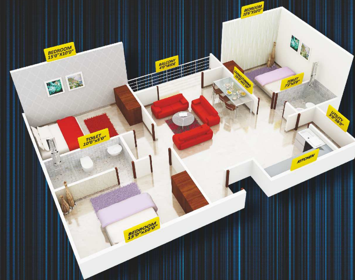
Flat 03, 3BHK, 1650 sq.ft