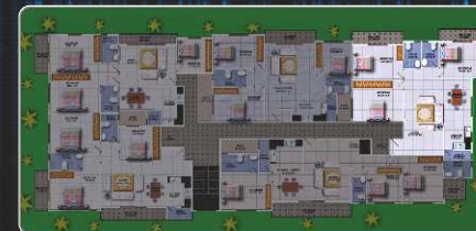
Flat 04, 3BHK, 1350 sq.ft