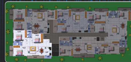
Flat 02, 3BHK, 1660 sq.ft