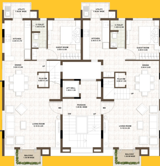
Typical Ground / Second Floor