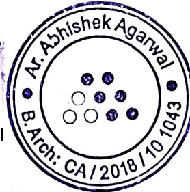
Ar. Abhishek Agarwal CA/2018/101043