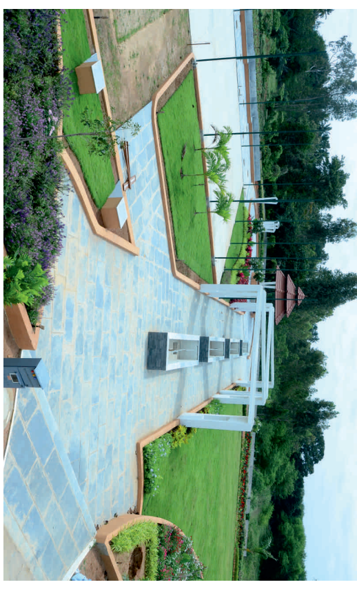
Actual Photos of Celebrity Pride Phase 2