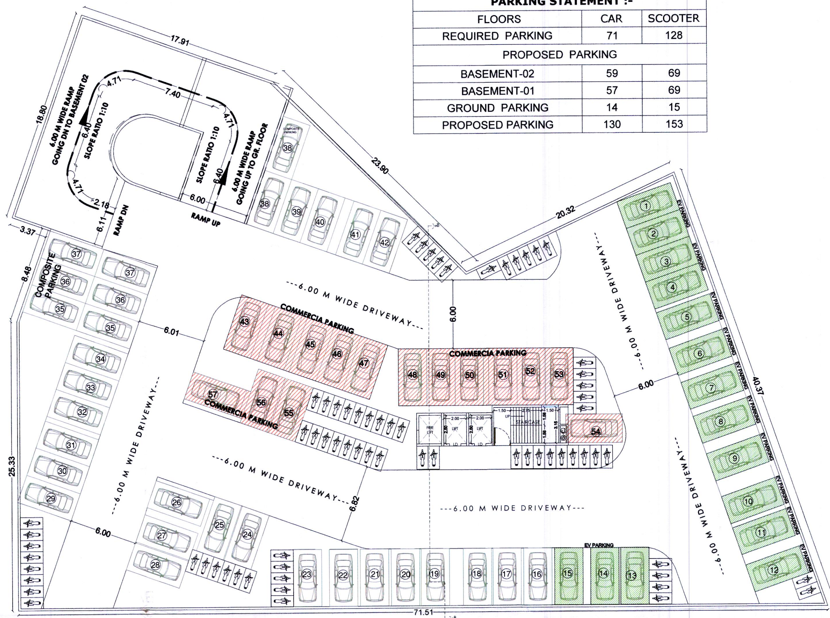
BASMENT LEVEL 01 FLOOR PLAN