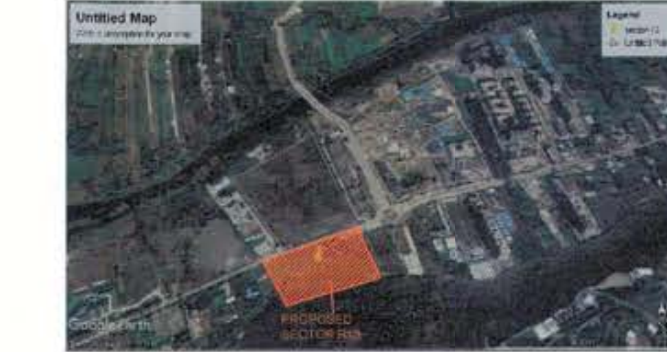
GOOGLE LOCATION PLAN